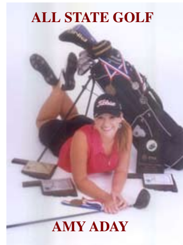
ALL STATE GOLF